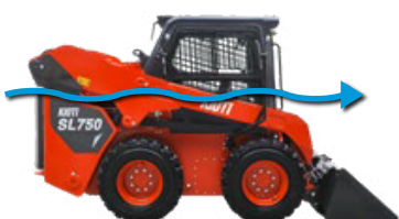
Ride Control "ON"

Ride control system helps to reduce operator fatigue and material spillage during operation. An accumulator helps to minimise shock, giving the operator a much smoother ride.