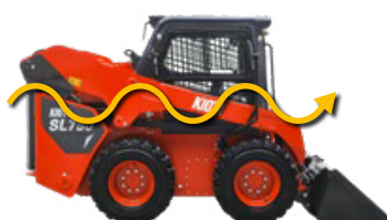
Ride Control "OFF"